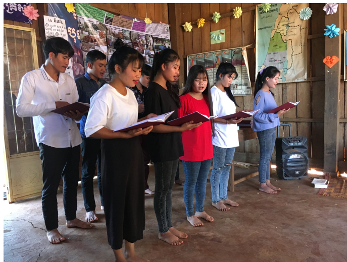
Sakrieng Church youth sing from the new hymnbook. Some of these youth are involved with the new church plant.